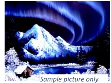
Sample picture only